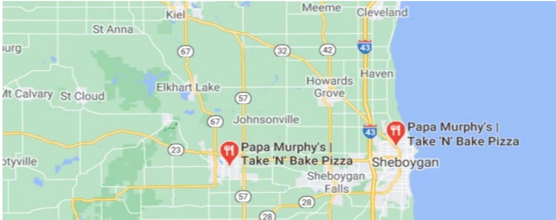
Sheboygan and Plymouth are within 20 minutes of each other